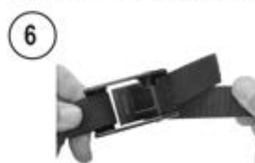
Tag End Pulled Out of Buckle (Top View)