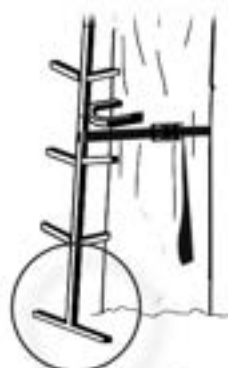
Figure 5 Bottom Rung T-Bar Firmly Set on Ground