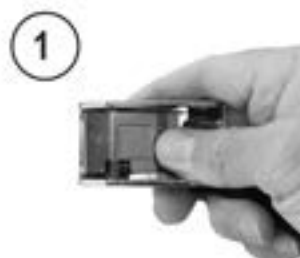
Depress "Press" Lever (Top View)