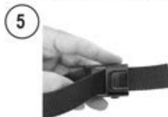
Tag End Pulled Out of Buckle (Bottom View)