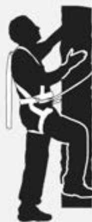
You Must Stayed Connected While Using This Product

WARNING! DO NOT jump or bounce on the treestand platform and/or the seat to engage the stand to the tree. Failure to follow these instructions may result in serious injury or death!