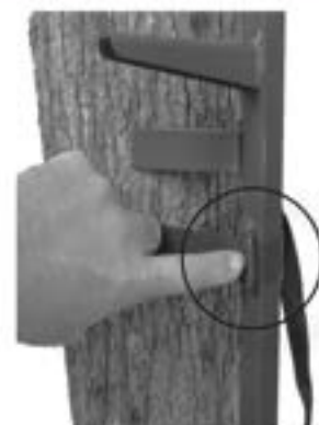
Figure 6 Cam Buckle Strap Through Cam Strap Buckle Loop