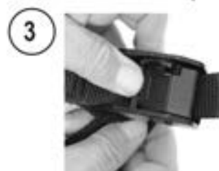
Push Webbing Through Buckle w/Lever Still Depressed (Top View)