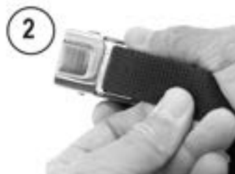
Insert Webbing Tag End Into Cam Buckle (Bottom View)