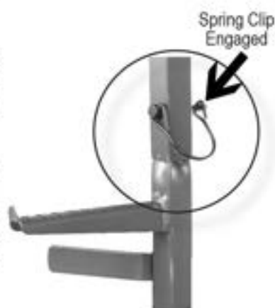
Figure 3 Secure Ladder Sections with Spring Pins

Slip the sections together as shown in Figure 3, securing the sections using the four (4) spring pins as shown in Figure 3. Make certain the spring clip is secured as shown in Figure 3. This precludes the spring pin(s) from pulling free from the ladder sections and the sections separating.