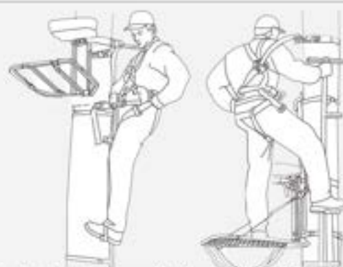
Prior to stepping onto or off of the treestand platform, you must attach your full-body fall arrest harness tether/lanyard to the tree trunk as shown to preclude you from being unattached.