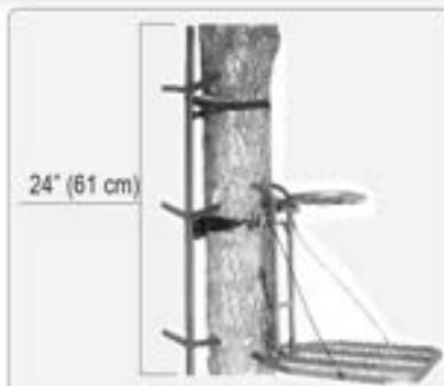
Climbing system must extend a minimum of 24" above standing platform.

WARNING! When using a lineman's belt/climbing belt to ascend the tree, the full-body fall arrest harness tree belt and lanyard must be attached to the tree trunk before stepping down onto the treestand. Failure to follow these instructions may result in serious injury or death!