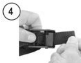
Pull Tag End Out of Buckle w/ Lever Still Depressed (Top View)